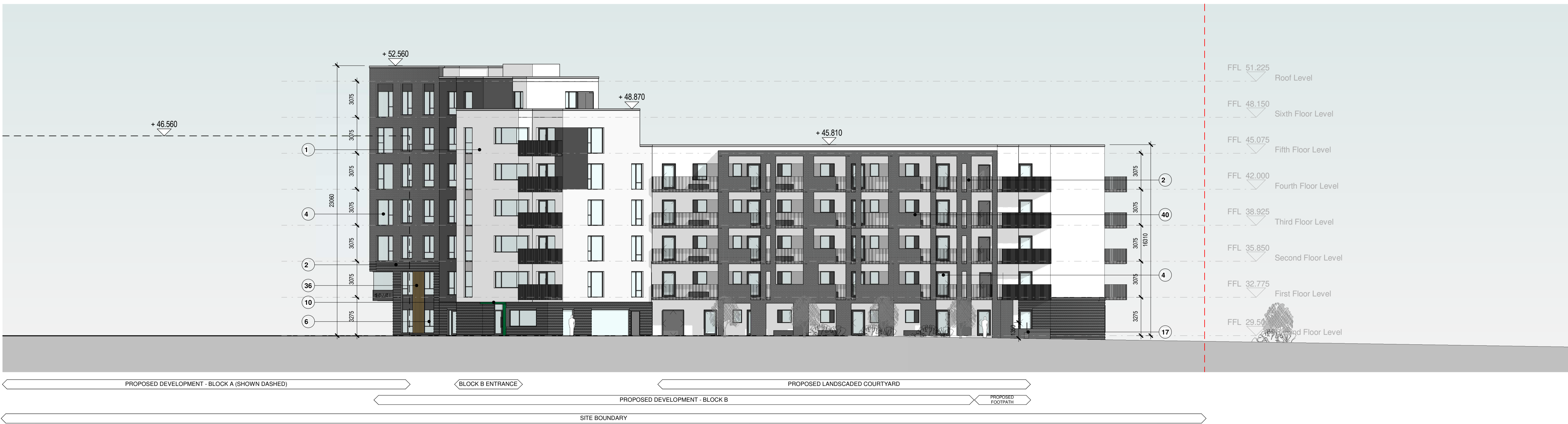
2 BLOCK B - NORTH FACADE 1 : 200