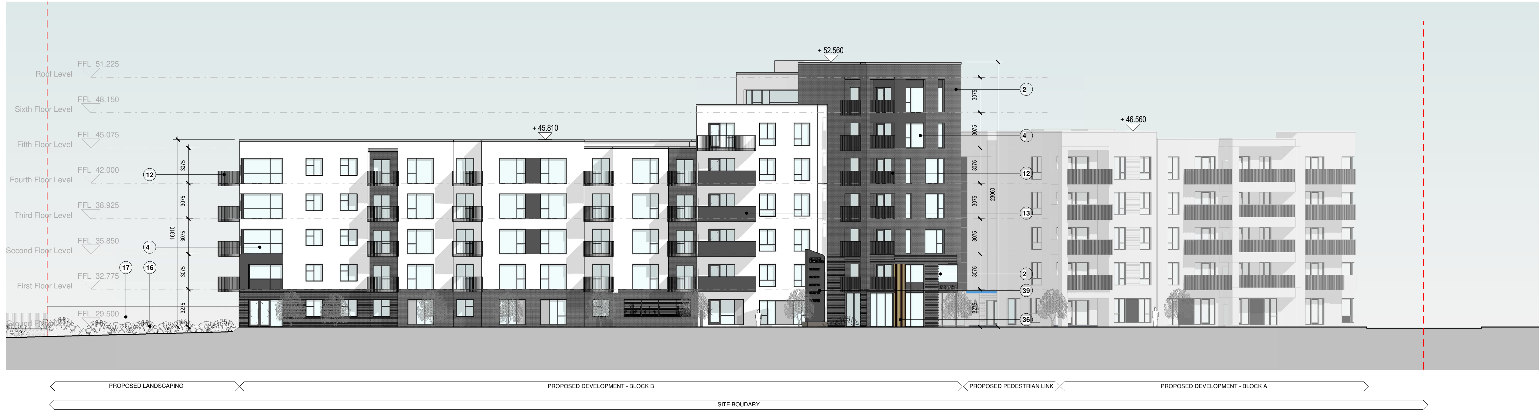
1 BLOCK B - SOUTH FACADE ALONG WESTERN DIST RD 1 : 200